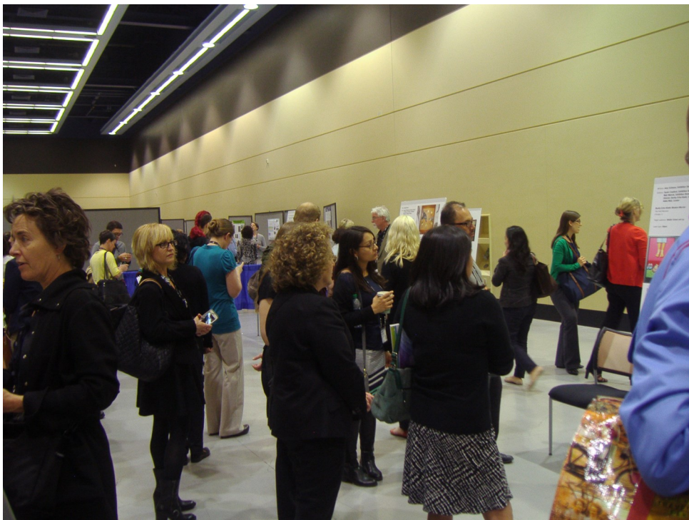
Marketplace of Ideas, Monday, May 19 – Attendees viewing the Label Writing Competition exhibit