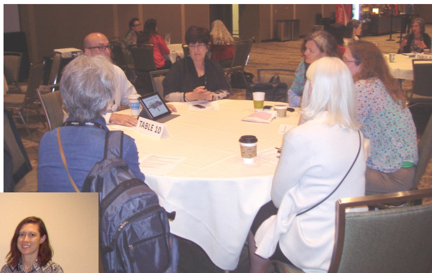
CurCom Table Talks, Tuesday, May 20