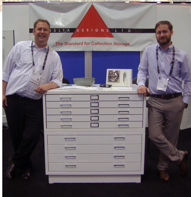
CurCom Professional Network Reception Sponsor Delta Designs Ltd.