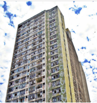
The Edifício São Vito in Sao