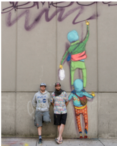
Octavio and Gustavo Pandolfo, street artists Os Gemeos (The Twins, in Portuguese) with their mural, in Boston.