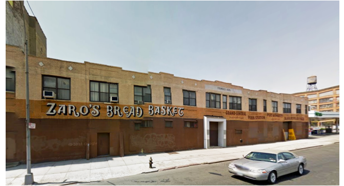
Zaro's' previous façade.