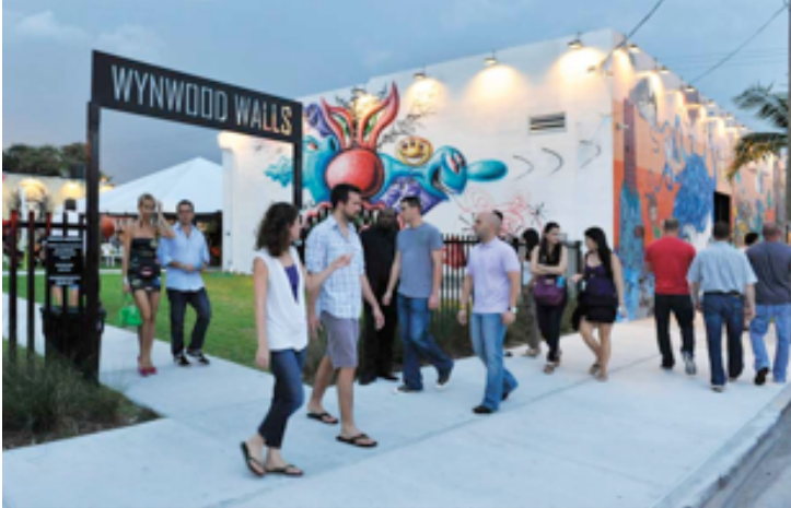
In Miami, street art murals have transformed – and gentrified – the area now known as Wynwood.

As for Zaro's? The bakery has been in its current location for almost 100 years. It survived the economic roller coaster of the 20 th century, the arson and destruction of the Bronx in the 1970s and 1980s, and the recession of 2008. However it wasn't until 2011 that Zaro's decided to paint the mural. What else was happening at that time? The gentrification of the surrounding Bruckner neighborhood. Nearby, the Clocktower building boasts loft apartments with a rooftop garden and lounge area, and a smattering of cafes and fusion restaurants have sprung up.