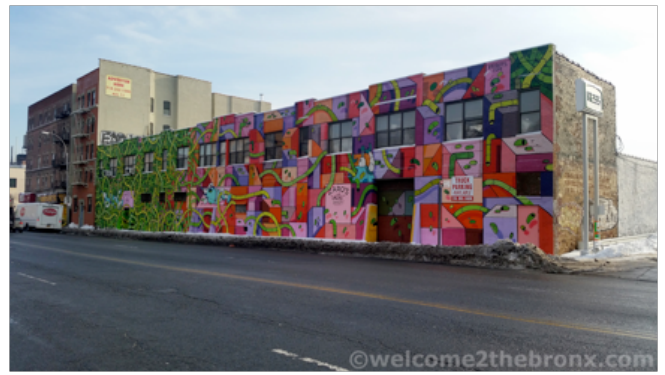
Zaro's Bakery industrial baking center, South Bronx.

Zaro's Bakery's central industrial bakery, located on Bruckner Boulevard in the southernmost tip of the Bronx, stands out from its surroundings. The bakery's 200-foot street façade features a floor-to-ceiling mural by street artist Nick Kuszyk. The piece is an eye-popping, exuberant fantasy of bubblegum pink, cartoon characters and green tendrils. However, this is not the bakery's first encounter with graffiti. A cached Google Maps street view from before the mural was installed shows the bakery's front surface marked with painted-over graffiti letters. Why would the bakery choose to paint over one form of graffiti and replace it with another?