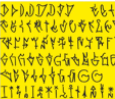
Pixação letter styles from the book Pixação: A São Paulo Alphabet , by François Chastenet.

Pixação is primitive and visually jarring, and reflects both the history of public political writing in Sao Paolo and the size of the city's urban underclass and poverty. The writers in Sao Paolo are mostly poor, underprivileged young men disenfranchised by society. While most observers see pixação as an urban affliction, few stop to question why its practitioners risk their lives for recognition—or the social conditions that might force them to do so. Fewer can read the cryptic messages spelled out by pixadores in a complex alphabet resembling ancient runes.