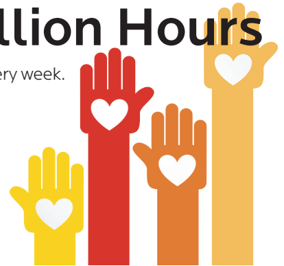
American Alliance of Museums 'Museum Financial Information Survey' (2009)

More than 2,000 museums participate in the Blue Star Museums initiative,