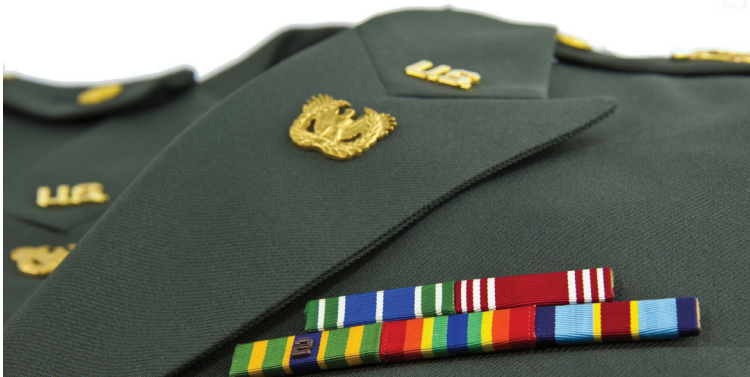
National Endowment for the Arts

offering free summer admission to all active-duty and reserve personnel and their families. This effort serves over 923,000 people.