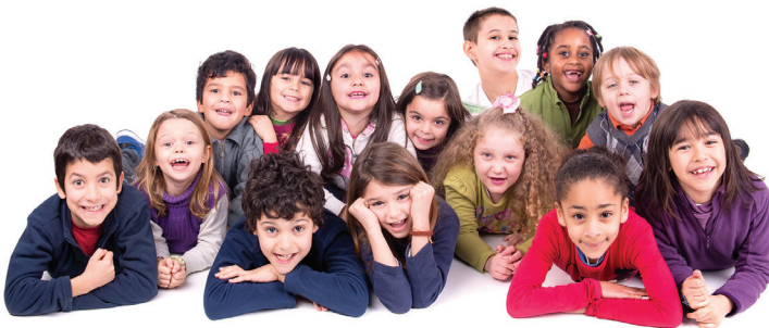
Education Next 'The Educational Value of Field Trips' (2014)

Students who attend a field trip to an art museum demonstrate improved critical thinking skills, historical empathy and tolerance.