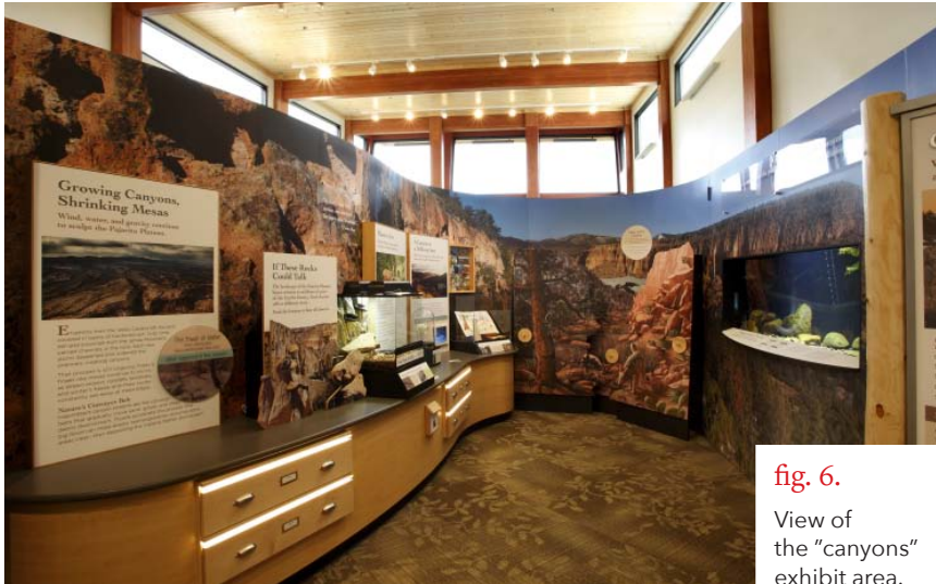
fig. 6. View of the "canyons" exhibit area.

and south sides of canyons. Pull-out tubes, swiveling panels, and buttons reveal sounds and objects one would hear or see in a Los Alamos County canyon. A lenticular graphic illustrates the dramatic changes that can happen to a landscape when a flash flood occurs. One wall of the canyons exhibit is dominated by a 700-gallon aquarium, showcasing fish of the Rio Grande (fig. 6).