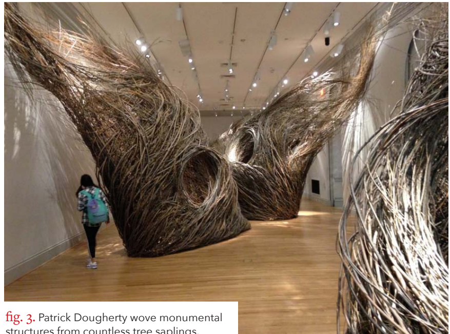
fig. 3. Patrick Dougherty wove monumental structures from countless tree saplings.

This exhibition is one I saw in Washington, DC during the annual AAM (American Alliance of Museums) conference. In November 2015, the Renwick Gallery—home to the Smithsonian American Art Museum’s collection of contemporary craft and decorative art—opened its doors after a major, two-year renovation. To celebrate, the museum was transformed into an immersive artwork with a debut exhibition titled WONDER .