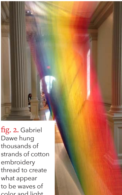
fig. 2. Gabriel Dawe hung thousands of strands of cotton embroidery thread to create what appear to be waves of color and light.