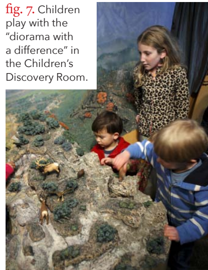
fig. 7. Children play with the "diorama with a difference" in the Children's Discovery Room.

Have you seen (or helped create) an exhibition that you'd like to share with colleagues in a future Exhibits Newline column? Email me for more information on how to contribute.