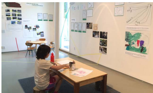
fig. 6. The map-making activity from Studio Purple.