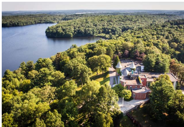
fig. 1. deCordova Sculpture Park and Museum.