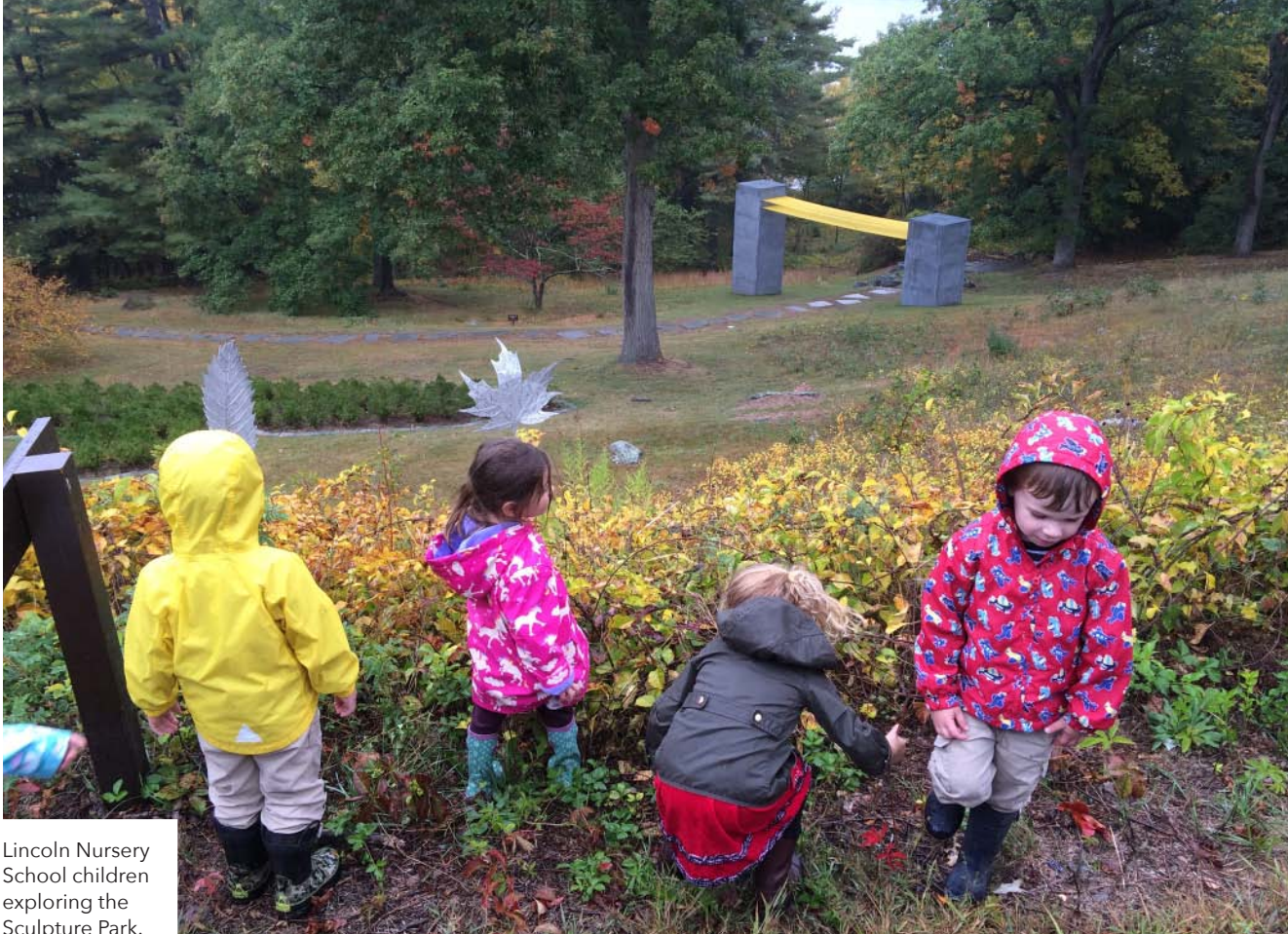
Lincoln Nursery School children exploring the Sculpture Park.