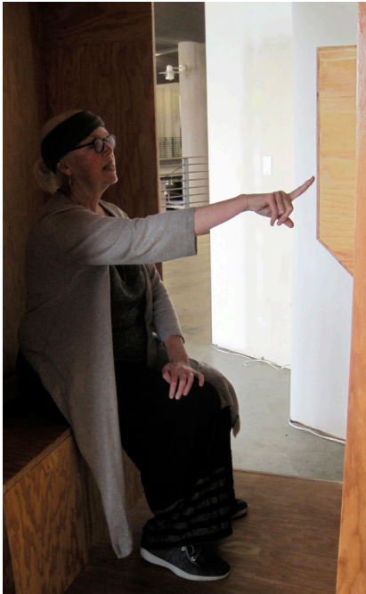
fig. 4. Video interview booth.