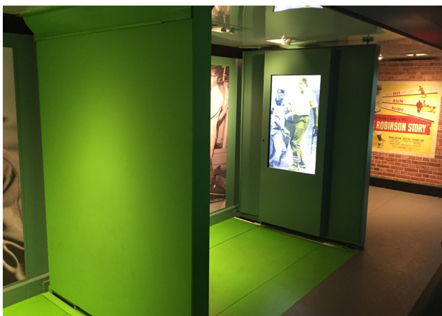
fig. 2. One interactive uses a green screen to photograph visitors and places them into historical moments in Major League Baseball.