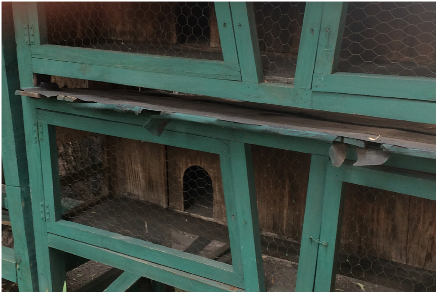
fig. 9. Crumbling rabbit hutches in the museum's courtyard.