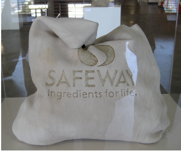
fig. 5. A leather shopping bag replaces the earlier petroleum-based version.