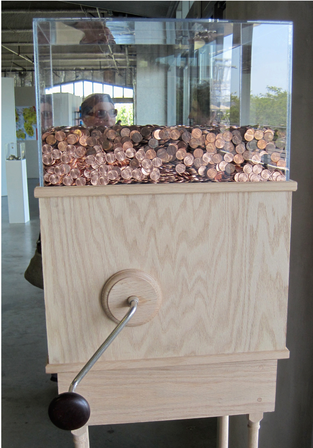
fig. 6. Hand-cranked minimum wage machine.