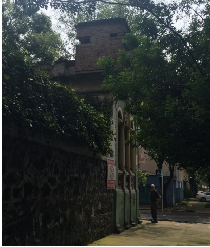
fig. 8. A makeshift guard tower still hovers above the largely hidden Trotsky house.

gain entry? Where was Natalia during the attack? Why did I feel such sorrow for Trotsky, who despite being a brilliant writer and orator was also a brutal demagogue? I sat on a bench (likely where Leon himself used to sit) and gazed at the cactus specimens that he had collected on clandestine outings in the Mexican countryside. They are still alive. Then my eyes turned to the rows of rabbit hutches; some were eroding. I envisioned a caged man finding brief moments of solace in front of the cages while he cared for his beloved pets (fig. 9.)