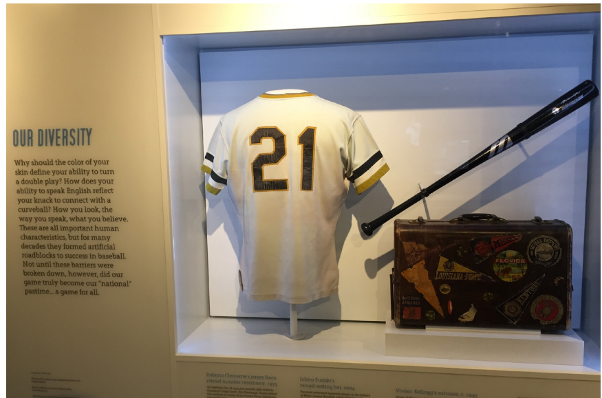
fig. 1. “We Are Baseball” celebrates the diversity of the baseball community.

On view at Principal Park, Des Moines, Iowa