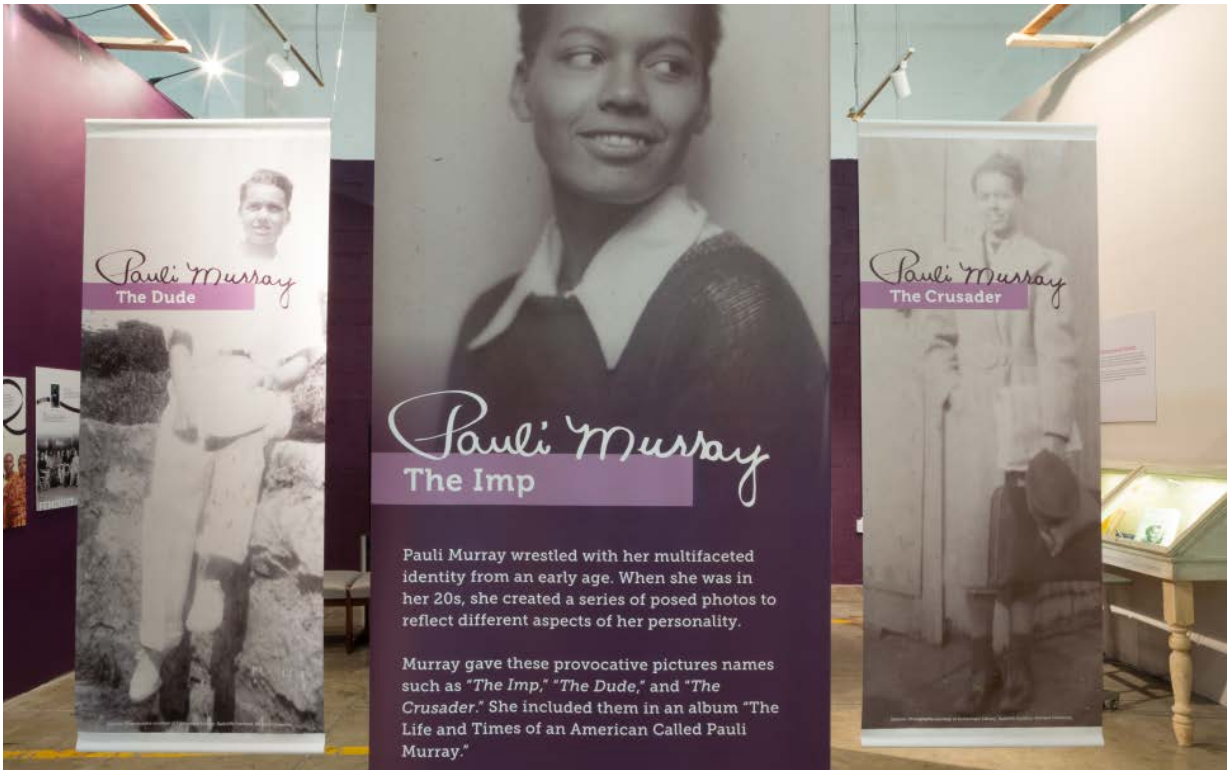
fig. 2. Pauli Murray: Imp, Crusader, Dude, Priest installed in the Cameron Gallery at The Scrap Exchange, a creative reuse arts center in Durham, North Carolina where it was experienced by more than 10,000 visitors.