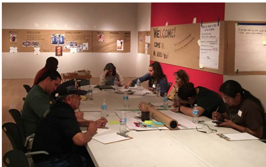
fig. 4. Master folk artists from New Mexico are invited to the Gallery of Conscience (GoC) to riff off of an early prototype of the current GoC exhibition, Negotiate, Navigate, Innovate: Strategies Folk Artists Use in Today’s Global Marketplace , with their own stories, thoughts, and comments about the ethical and social issues involved in today’s global marketplace (July 2016).