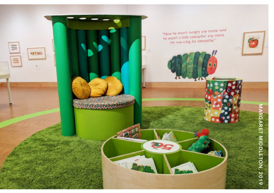
Fig. 4. Nurturance: shades of green and natural woodgrain communicate warmth and growth in The Very Hungry Caterpillar Turns 50 exhibition at the Eric Carle Museum of Picture Book Art in Amherst, Massachusetts.

Softness. Softness is forgiving and accommodating. A soft environment is conducive to comfort and conversation. Texture, form, and even light and sound quality together contribute to an overall sense of softness through the addition of upholstery, acoustic paneling, and curtains. These components often incorporate textiles, longtime symbols of domesticity and women's work.21 As part of the 2015 exhibition Wonder, artist Janet Echelman's installation transformed the Renwick Gallery's Grand Salon with textiles. In addition to her hammocklike, nylon-fiber artwork hanging from the ceiling, she also used diffused light, a soft, quiet carpet made from repurposed fishing nets, and squishy beanbag chairs from which to observe the entire effect (fig. 3).