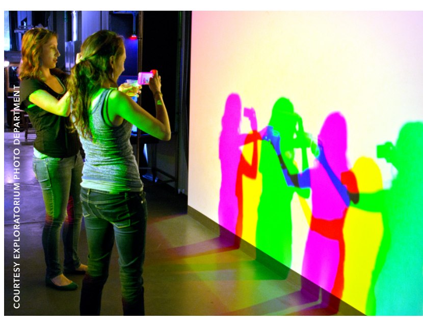
Fig. 6. Color: visitors play with their colorful shadows at the Exploratorium in San Francisco, California.