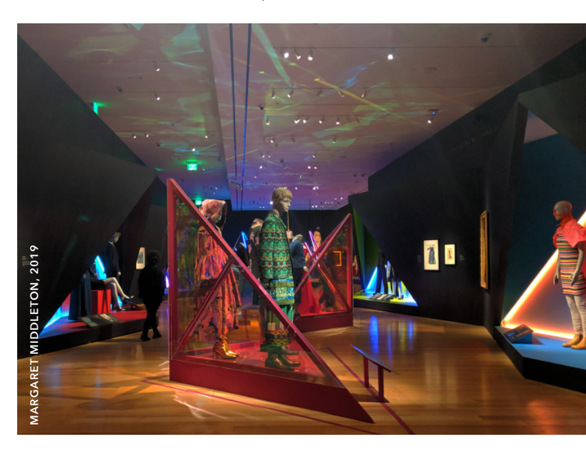
Fig. 5. Sparkle: exhibit lighting ricochets off dichroic acrylic panels, creating a sparkling effect in the Gender Bending Fashion exhibition at the Museum of Fine Arts in Boston, Massachusetts.

Color. The go-to color for femininity may be pink, but bright colors in general are associated with femininity. Whether you are in the mall, the deodorant aisle, or on the red carpet, you will notice items for women tend to be lighter, brighter, and more colorful and items for men are more likely to be darker and confined to a smaller range of color. In contrast with those darker, more muted colors which are considered serious, bright colors are perceived as playful. Bright color can inject beauty, levity, and playfulness into an environment. One of the exhibits that ranked well in the EDGE research project was an Exploratorium exhibit in which visitors play with their brightly colored shadows (fig. 6).