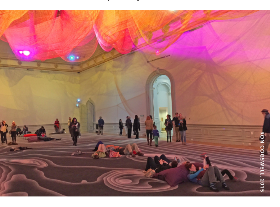
Fig. 3. Softness: visitors lounge on soft carpet and beanbag chairs to gaze up at the undulating installation 1.8 Renwick by Janet Echelman at the Renwick Gallery, Washington DC.