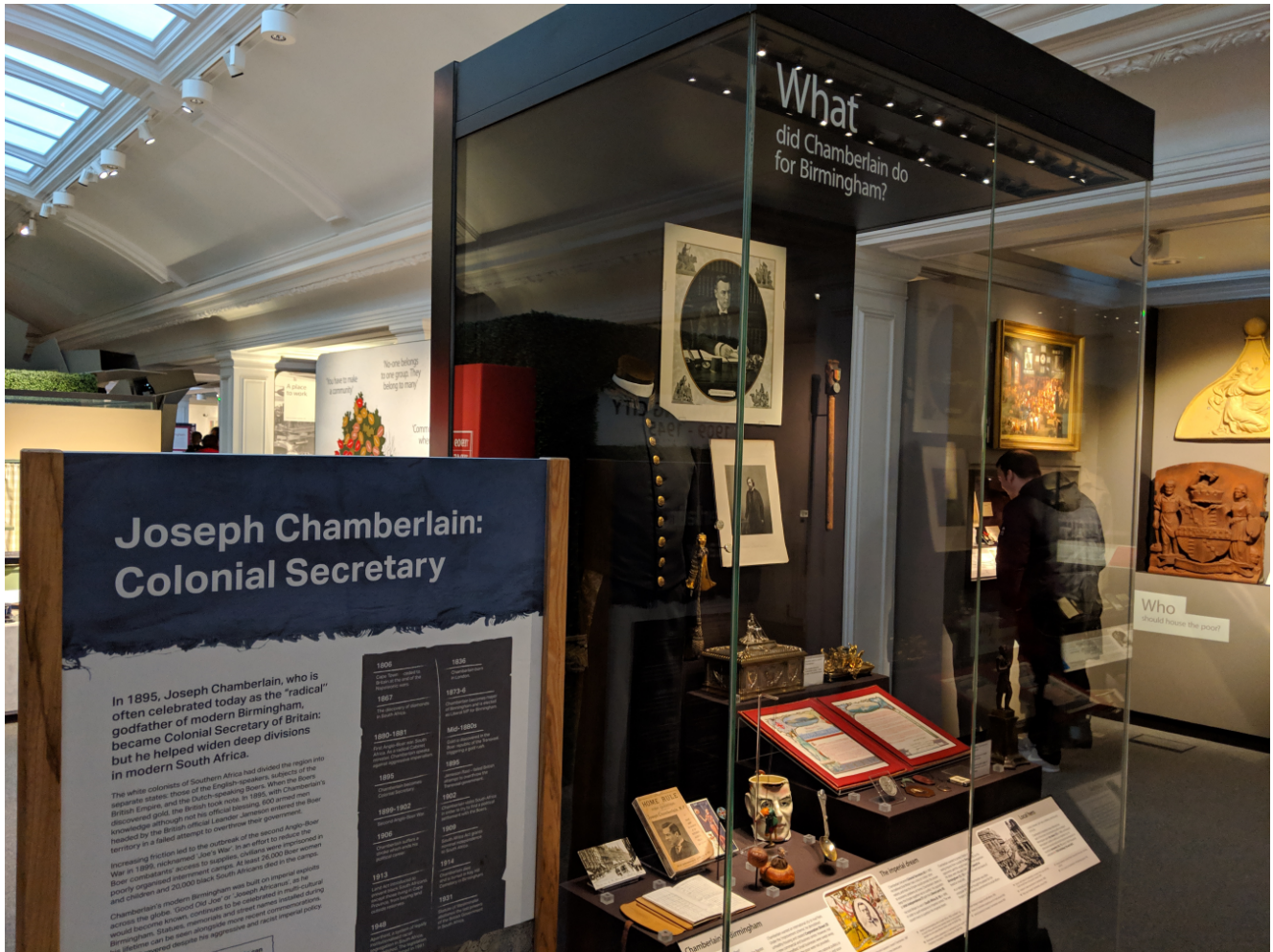
Fig. 4. January 2019: on the left, the panel from The Past is Now: Birmingham and the British Empire about Joseph Chamberlain. On the right, the permanent display in the main social history gallery.

BMAG archives describes the knives as a potentially “amusing addition” to the museums collection. As a visitor articulated in an interview: