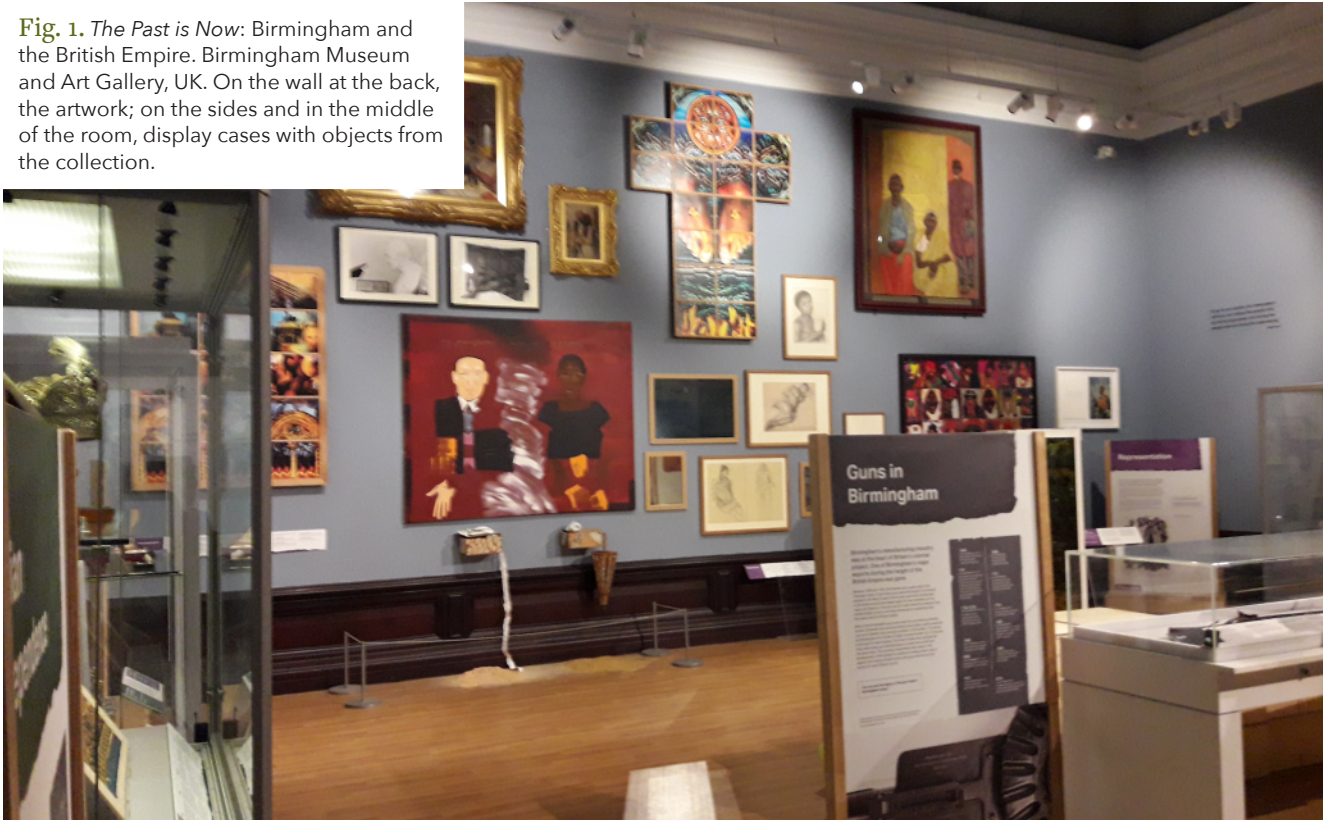
Fig. 1. The Past is Now: Birmingham and the British Empire . Birmingham Museum and Art Gallery, UK. On the wall at the back, the artwork; on the sides and in the middle of the room, display cases with objects from the collection.