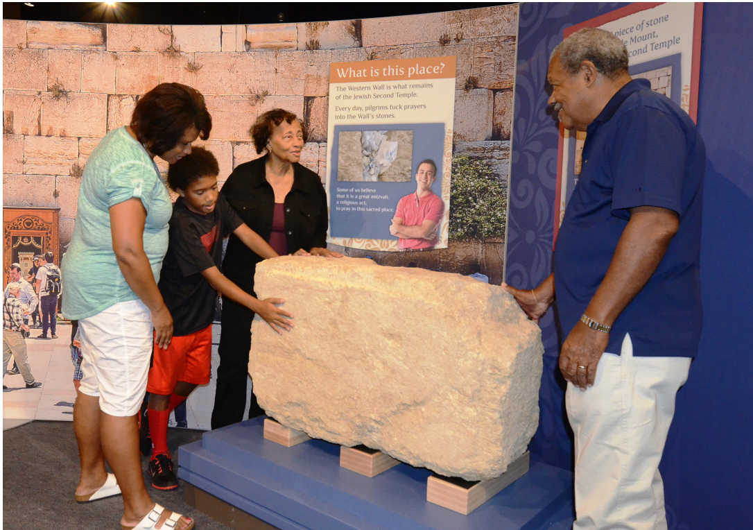
fig. 7. Families interacting with a reproduction segment of the Western Wall in National Geographic Sacred Journeys .

to use the FLORES system to help planning teams understand more fully how visitors would react to certain objects and their potential to spark conversations about the objects. Using the tool also helped teams to think about the degree to which they felt the object worked to tell the story of each exhibition.