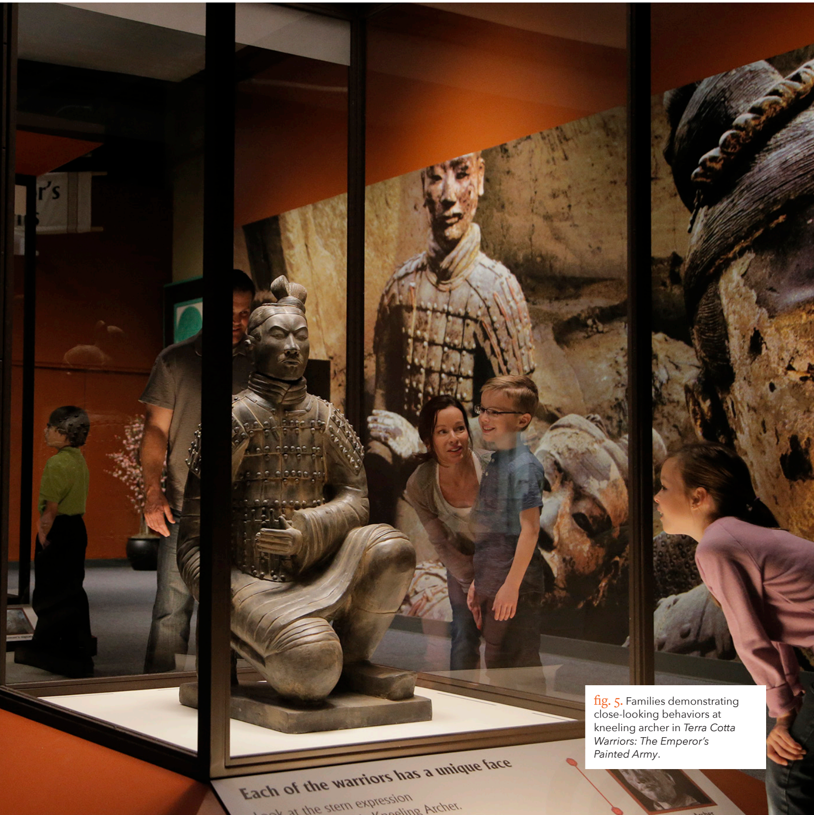
fig. 5. Families demonstrating close-looking behaviors at kneeling archer in Terra Cotta Warriors: The Emperor's Painted Army.

Each of the warriors has a unique face Look at the stern expression of the Kneeling Archer.