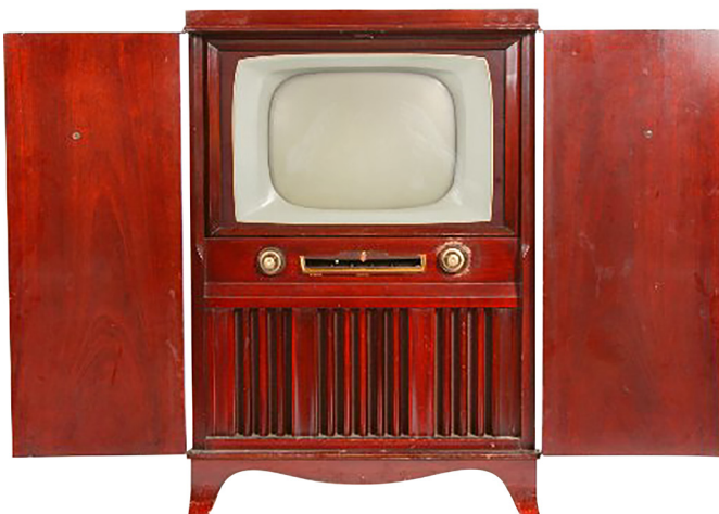
fig. 2. Crosley television set, 1940s.