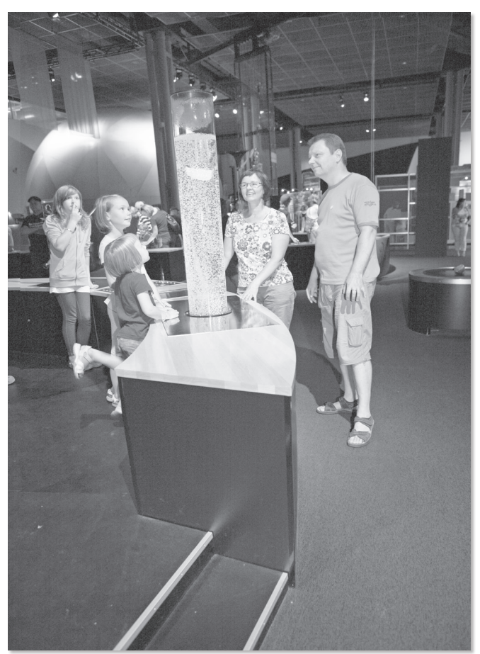
The design allows the kids to meet with the adults on a more equal level.