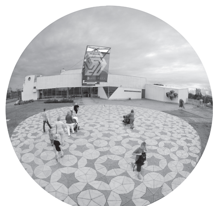
Heureka, The Finnish Science Centre, has been visited by over 6 million visitors since 1989. A total of around 18 million people have experienced its exhibitions around the world.