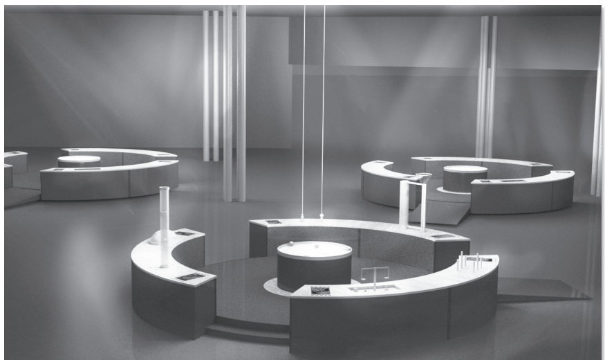
Design concept of Heureka Classics with thematic arenas. The ten-button multilingual labels lie flat on the table tops.