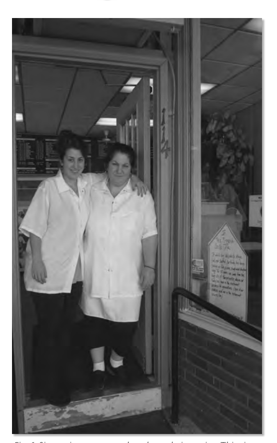
Fig. 6. Sign writers are proud to share their stories. This sign, at Cambridge's Village Grill & Seafood, told how the owners had traveled thousands of miles from Greece to start a business and to live the American dream. The sign says that their best dishes are "delicious pizza" and "fresh baked haddock," delivered from Georges Bank three times a week.

ITHCT challenges traditional museum hierarchies and methodology, and the result is a vibrant public history happening (fig. 6). Consider trying it yourself! You are welcome to use the name and our template; just let us know about your project so that we can post it to the website.