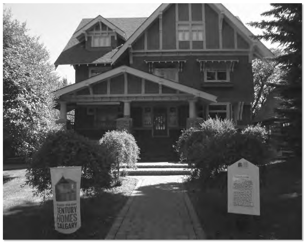
Fig. 3. Calgary's event celebrated the city's first building boom, when the railroad came to town. This bungalow was built in 1913.

Calgary Week. The goal of the project was to celebrate Calgary's old homes—most of them about 100 years old, built during Calgary's first boom—with the hopes of ensuring their preservation. The CHI was concerned about losing historic homes to new development, a problem in many inner-city neighborhoods.