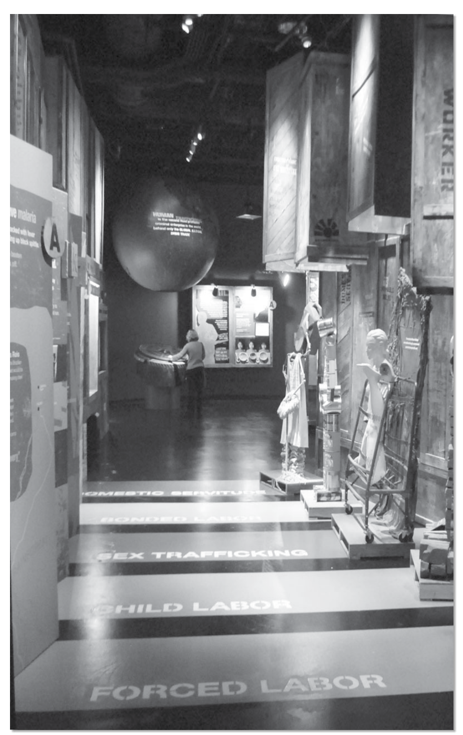
Entrance to Invisible: Slavery Today.

Securing the initial funding created the momentum needed by the Freedom