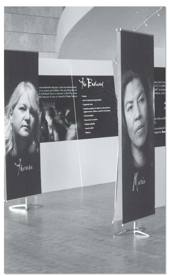
Original Invisible: Slavery Today traveling exhibition .

The exhibition team proposed the complete renovation of approximately