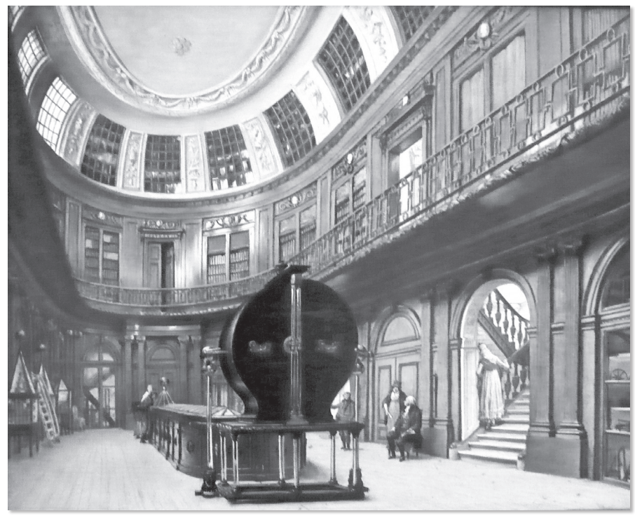
The Oval Room at Teylers Museum, with Martinus van Marum's electrostatic generator in the foreground, as painted about 1800 by Wybrand Hendriks.

(Turner, 2001), and a huge collection of old masters' prints and drawings. It was here that von Marum built his famous electriseermachine , an immense electrostatic generator, comprising two spinning glass discs, each 65 in. in diameter, with the potential of producing a two foot long, 2000 Joule bolt of lightning, "the thickness of a quill pen" (Curry, 2003). Van Marum would perform experiments and public demonstrations with the machine, requiring four people to turn the crank, generating massive arcs, melting metal wire, magnetising needles, and allegedly electrocuting small animals. "Persons within 10 feet of the plates experienced a sort of