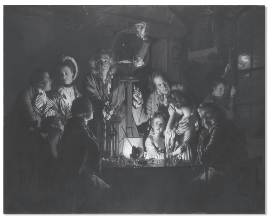
"An Experiment on a Bird in an Air Pump" by Joseph Wright of Derby, 1768, oil on canvas, Courtesy of Tate Gallery, London.