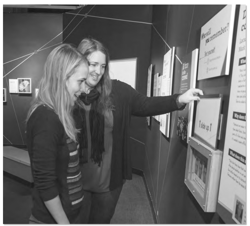
Fig. 6. In our Portal to Current Research exhibition space, we experiment with what we have learned from the cohort.

of the exhibition were most important, whether they discussed the content after leaving, or if they did something to follow up on what they learned, such as seek more information online or watch a documentary. Posing broader questions than the in-person surveys, the postvisit surveys are used to gather feedback about the impact individual exhibitions are having on people. We ask the cohort, "Are there still elements that are particularly memorable?," "How important were each of these exhibit elements?," "Has anyone in your group talked about the theme or content presented in The Studio with friends, coworkers or amongst yourselves?" Their answers have given us a good sense of what information resonates with families and, upon reflection, which exhibit elements made their visit meaningful.