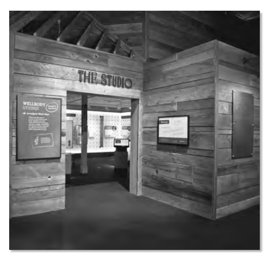
Fig. 1. The Studio is a small, change-ready exhibit space.

acific Science Center has long had a strong set of programs connecting scientists and current science content with the public, including "Research Weekends," "Science Cafés," and the monthly "Scientist Spotlight." Beginning in 2007 with a grant from the National Science Foundation, the Portal to the Public program started training scientists to communicate their research to the public. 1 After years of training scientists and hosting programs, we saw the need to create a permanent home for current science on our exhibit floor in order to maximize exposure to current science content. "The Studio" (fig. 1) is a rapidchange, reconfigurable, hybrid program/ exhibition space (fig. 2) that features current health science research from the Pacific Northwest. This project uses a consistent group of audience participants (our "cohort") and puts our audience at the center of the process. Flexibility and rigorous evaluation have enabled us to be increasingly nimble and responsive to current issues and our visitors' interests.