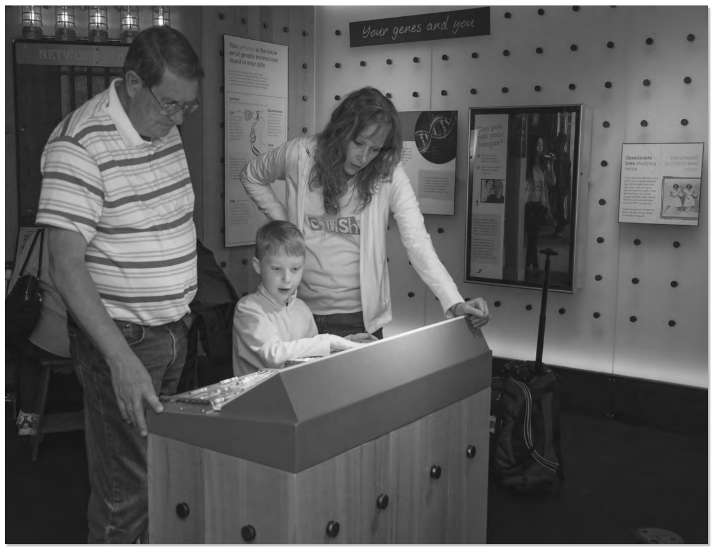
Fig. 5. Our visitors help us refine each subsequent exhibition and exhibit component. The cohort has the added advantage of having seen past exhibitions and exhibit components.

reading or hearing about this topic?" and "What are the first two or three words that come to mind when you hear about this topic?" Then we ask respondents how curious they are about a topic, and, if they are curious, what questions they have about it. These findings help us design a space that quickly addresses what visitors already think and know so we can dedicate more space to explaining basic concepts and local research.