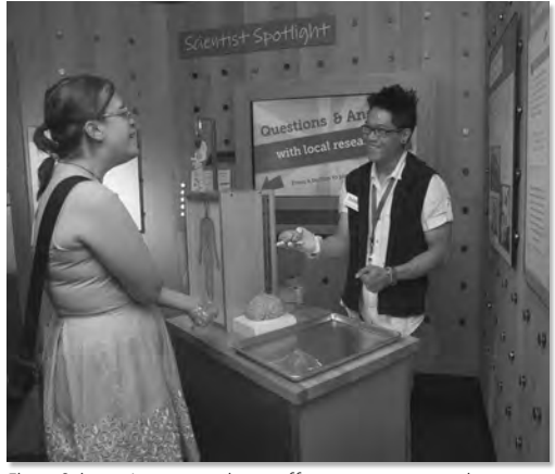
Fig. 2. Science Interpretation staff present programs in the space every day, with cart activities specific to each exhibition. On the first Saturday of each month, scientists present in the exhibition space and throughout the museum.

Launched in 2012, and changing every six months, The Studio serves as a way to integrate current science into a larger permanent health and wellness exhibition, Professor Wellbody's Academy of Health and Wellness. The Studio is a 500-squarefoot exhibition space that was designed to be change-ready in the sense that graphics, monitors, and cases can be reconfigured easily and quickly. The walls are covered in a matrix of equidistant metal pegs (fig. 3), and every wall-mounted component is outfitted with corresponding cleats. Graphics are printed on magnetic vinyl (fig. 4) and placed in presized metal frames. Featuring removable tops, the kiosks have been used to mount touchscreens and hands-on interactives as well as to display models.