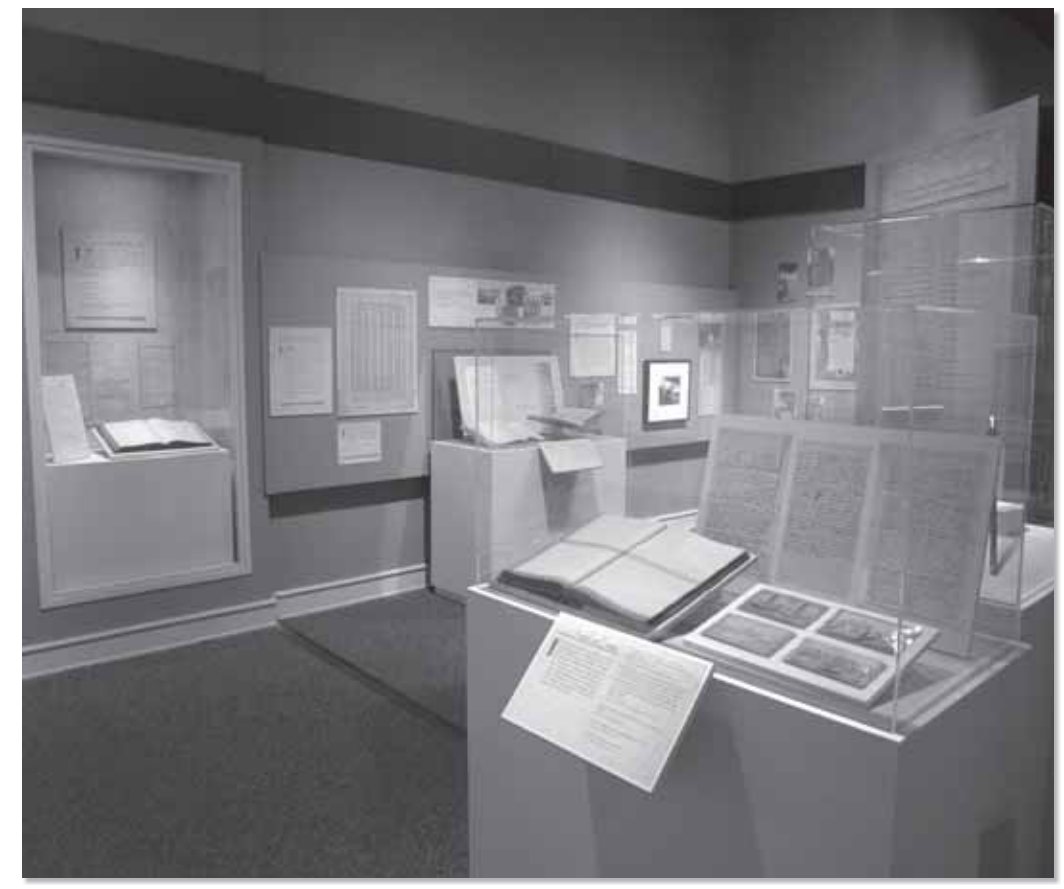
From the exhibition, Let the Records Show: Discovering the Valley's Black Community in Slavery and Freedom, Columbus Museum, Columbus, Georgia.

up the exhibitions curator hat (though opportunities to co-curate an exhibition have already presented themselves and will continue to do so), it is gratifying to have the opportunity as an administrator to support and nurture an already robust exhibitions program: moving it into the future, attracting more visitors, users, potential donors, and friends and giving them the opportunity for "spontaneous learning" in our historic special collections library. The next frontier in exhibition development is already being explored and exploited. We are working towards building that virtual world where exhibitions can live and thrive in digital format. And while many repositories have tackled this affiliated task, there is much to learn about how the exhibition can