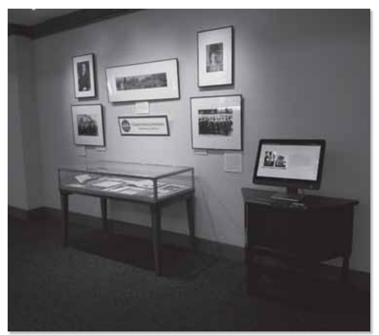
Teaser exhibition for upcoming major exhibition on the 100<sup>th</sup> Anniversary of the Smith-Lever Act, celebrating Cooperative Extension. The exhibition features rare documents, published materials, photographs, and a touch-screen monitor with oral histories.