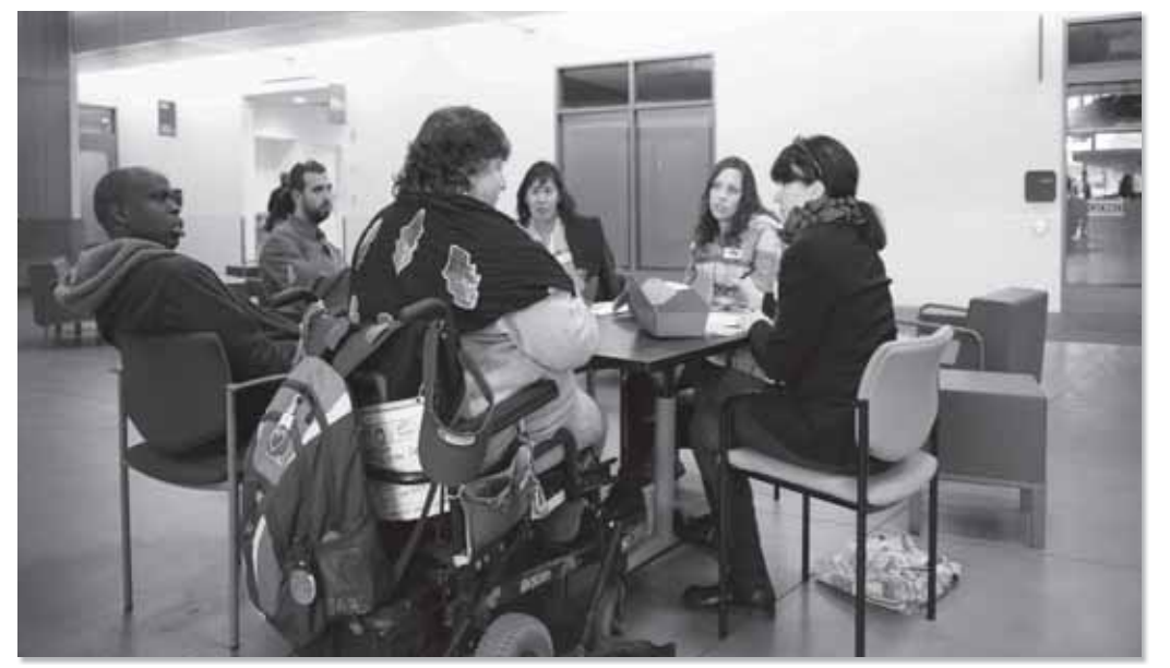
A small break-out group at the accessibility workshop discusses the visitor experience and the challenge of competing accommodations.

Documents that encourage sensitivity such as Disability Etiquette produced by the United Spinal Association describe preferred terms and the ways that language has stigmatized and sidelined people in the past. At the same time, however, the use of "people first" language is problematic for some in the autism community who may prefer to identify as "autistic" rather than a "person with autism," and members of the Deaf community, who do not consider deafness a disability and prefer to be called deaf rather than "a person with deafness."