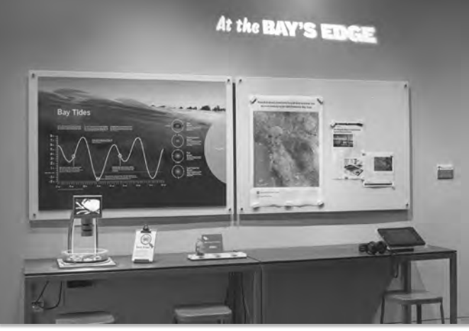
62 EXHIBITIONIST SPRING '15

An important benefit to dedicating space for feedback on the bulletin boards is that we can learn about our visitors in a low-cost and relatively unobtrusive way.