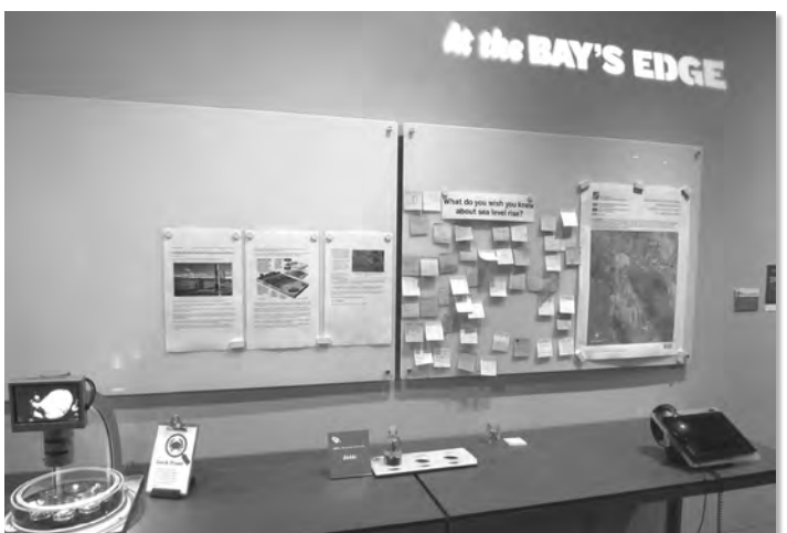
Fig. 3. Before: the bulletin board as a prototype space. What are visitors saying?

isitors saying? Fig. 4. After: We used a large graphic to explain the basics of how tides work along with a found graphic predicting sea level rise.