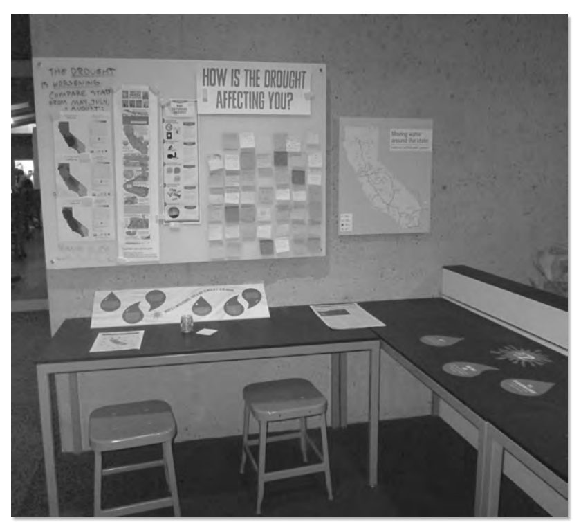
Fig. 2. This handmade-looking, visitor-friendly space conveys the urgency of the drought situation in California.