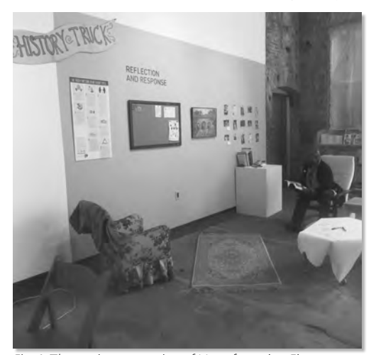
Fig. 6. The stationary version of Manufacturing Fire at Little Berlin gallery included a reflection space for visitors to review History Truck's process, a community corkboard, photographs from recent block parties, a curatorial library, and a place to comment on local buildings perceived as being susceptible to fire.

designate spots of community activism, and key words from the original memories on muslin. The entire map was placed on a carpet to allude to the neighborhood's carpet industry with the memories on muslin for review separately on key rings (figs. 4 & 5). This piece was featured in the stationary version of Manufacturing Fire as well as on the sidewalk of Philly streets during the truck's pop-up events. This interdisciplinary exhibition (fig. 6) included sound clips from the oral histories, physical, touchable interpretations of community stories, and the objects shared at the public events. I wrote text, Klein designed the look and feel of the panels and the vinyl lettering, and our team of volunteers installed the exhibition at Little Berlin, whose gallery