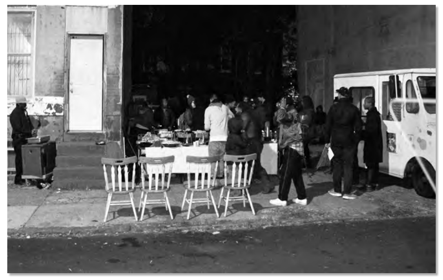
Fig. 3. In collaboration with community partners, History Truck hosts Storytelling Block Parties in underused spaces. We conduct oral history interviews in the truck while attendees map and share memories over a meal. Photo by Jill Saul, 2014

By being present on the block . . . I was able to learn what memories occupied the minds of residents and what stories they wanted to understand better.