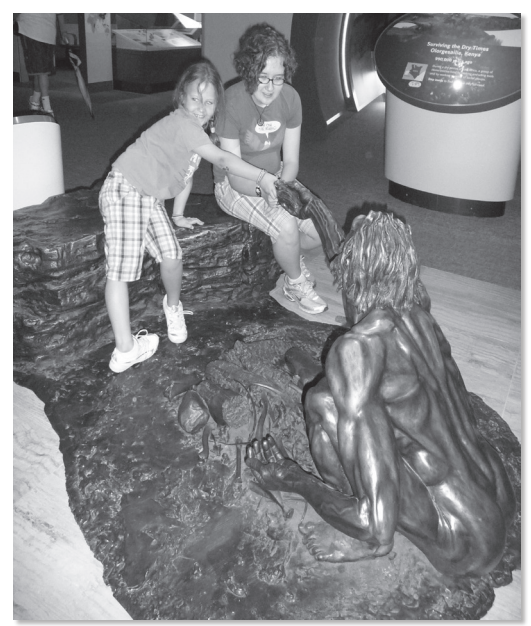
Lifesize bronze sculptures are beautifully executed. Here, two young visitors get up close to one of five different early human species that lived between 2.3 million and 17,000 years ago, and that are now extinct. Hall of Human Origins, NMNH.

The exhibition explores 6 million years of scientific evidence about human origins and the stories of survival and extinction in our family tree during times of dramatic climate instability. The exhibition content is based on research by Smithsonian scientists and that of other researchers from around the world. The exhibition design was open, and the exhibit cases with specimens were beautiful. The touchable cast reproductions of real skulls were a highlight for my kids—they loved being able to compare one to another, and to touch. The "Snapshots of Survival" components were the least engaging aspect for me because they