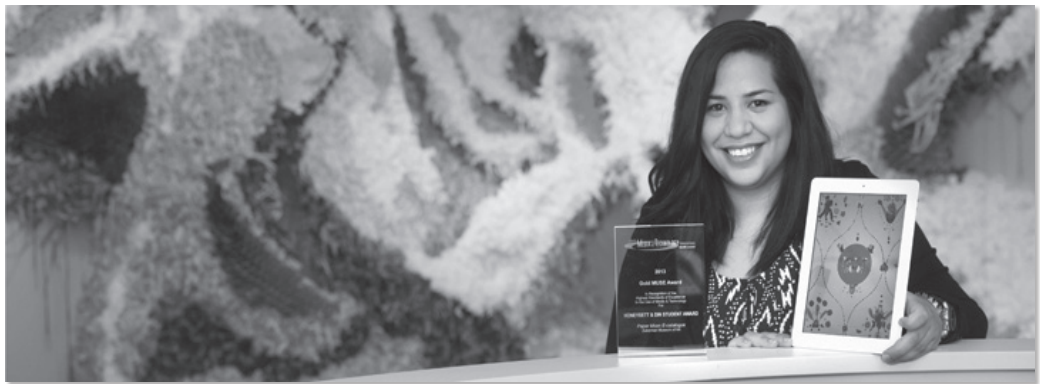
Cover of the Paper Moon e-catalogue. The catalogue contains audio, animation, and interactive components.

Museums continue to pursue interesting and effective ways to publish content online.