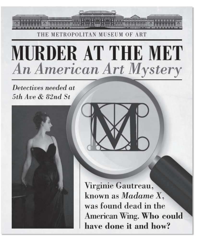
Murder at the Met: An American Art Mystery. Launch screen designs were inspired by 19<sup>th</sup>century broadsheet newspapers. Suspect and victim game pages were based on 19<sup>th</sup>-century police crime blotters. Game play was inspired by classic board games such as Clue.