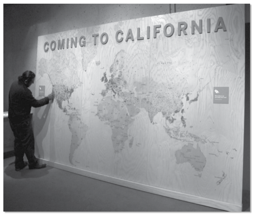
Upon entering the Coming to California gallery, visitors are asked, "Where did you and your family come from? Put a dot on the map." The exhibit was planned as an elaborate digital interactive element, and this was the simple prototype. After watching visitors engage with this simple prototype, and observing their animated intergenerational conversations, staff decided to retain the prototype version.