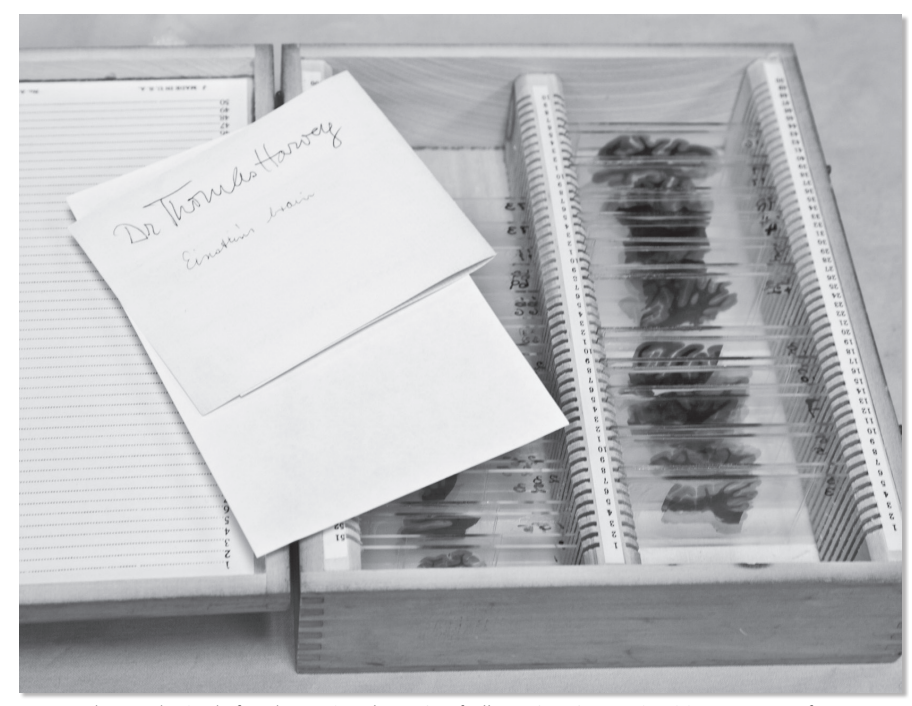
I've seen human brains before, but seeing The Brain of Albert Einstein, was inspiring.

But once we actually got to open cases to view the collection, it was amazing. The astounding number and diversity of specimens really allows visitors to understand the mystery and beauty of the human body, how much the medical profession has learned, and how much more they have to figure out. Nineteenth century instruments, skulls, organs in jars, and full skeletons fascinate many and clearly identify those that are squeamish. To my surprise, there were