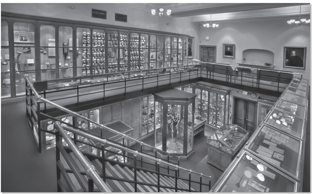
The Main Gallery of Philadelphia's Mütter Museum is a beautiful space architecturally, but very difficult to navigate when crowded.

Neither is better than the other...They're just different.