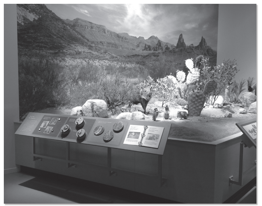
This exhibit at the Perot Museum of Nature and Science offers sounds, smells, and tactile encounters with Texas' natural history.