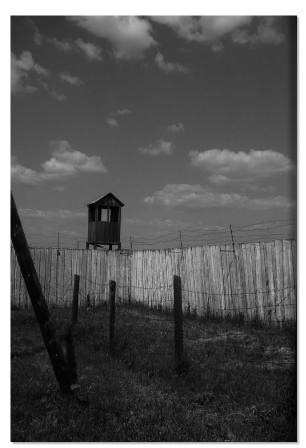
The watchtower at the Gulag Museum at Perm-36.

is the idea of "stimulating dialogue on pressing social issues." The Coalition's accreditation criteria elaborate that "We believe it is the obligation of historic sites to assist the public in drawing connections between the history of a site and its contemporary implications, and to inspire citizens to be more aware