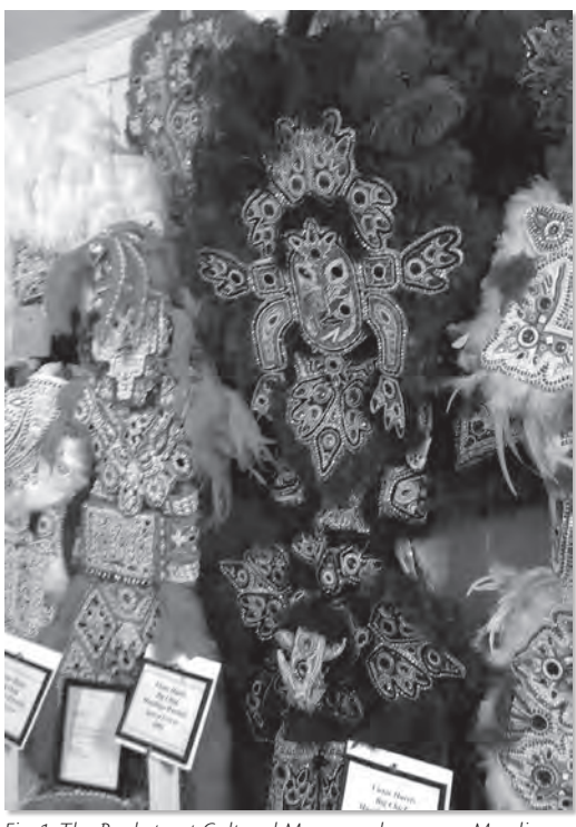
Fig. 1. The Backstreet Cultural Museum showcases Mardi Gras Indian costumes.

In addition to Mardi Gras Indians, the museum is actively collecting objects, videos, and oral histories from New Orleans' African American community. We saw costumes and memorabilia from the social aid and pleasure clubs and watched videos of