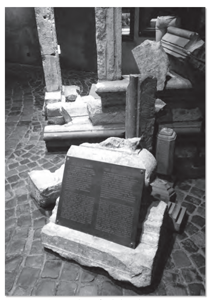
Fig. 3. An interesting approach to artifact display at the Warsaw Rising Museum.