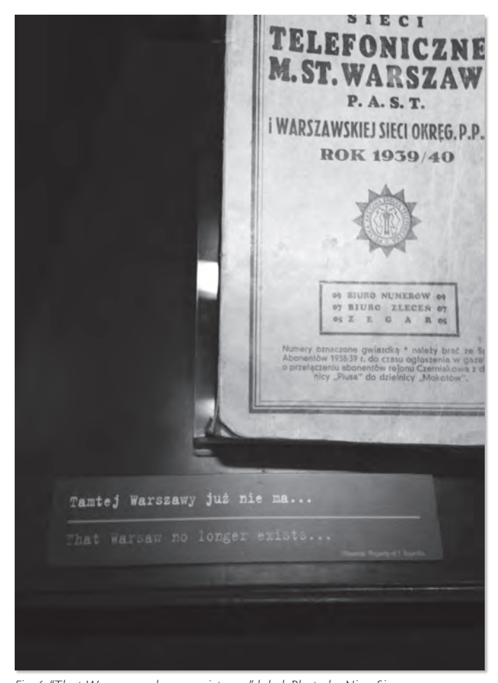
Fig. 4. "That Warsaw no longer exists.. " label.