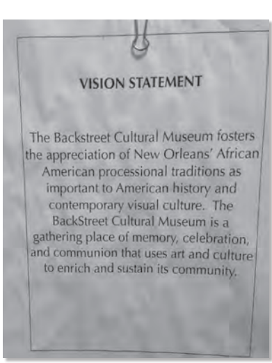
Fig. 2. The museum proudly posts its vision, mission, and goals statements for all to see.

Jazz funerals and Indian events, which I learned occur throughout the year, not just on Mardi Gras. The best part of the experience was the personalized tour provided by the museum's docent, who is also chief in one of the Indian tribes and who shyly pointed out the costumes he has made over the years. He showed us how costumes are constructed—it takes a year to make a single costume and no two are alike—and explained the origins of the various tribes and their relationships. He was the best guide I have ever had: enthusiastic, knowledgeable, and sincere. As we left he invited us to come back to the museum next Mardi Gras to be part of the second-line parade that starts at the museum and winds its way through the Tremé. I'm already planning my costume.