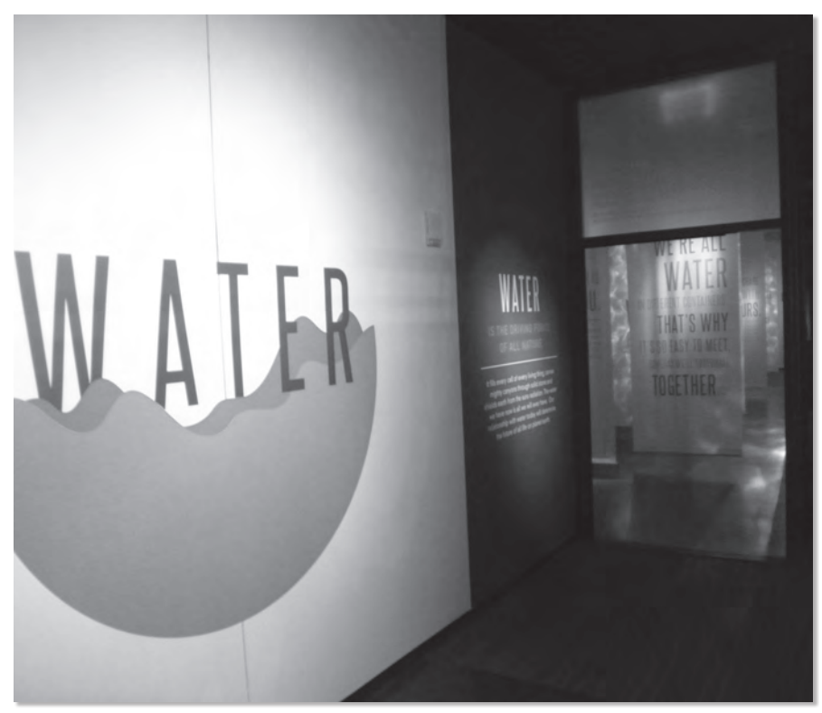
Fig. 5. Entrance to the Water exhibition at The Leonardo, Salt Lake City, Utah.

And lastly, Eugene Dillenburg shares his experiences from Water , an exhibition on display at The Leonardo in Salt Lake City: