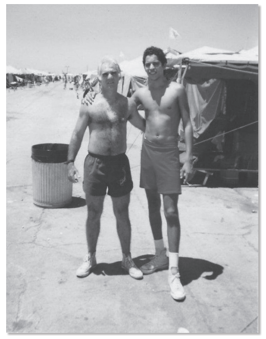
Image posted by Raul Lopez on Balseros Cubanos Facebook page. Courtesy of Raul Lopez.

Each panel contains a QR code through which visitors can link to deeper digital content through their smartphones. including three to five minute audio portraits of people with diverse GTMO stories. Students were invited to work together to build a virtual portrait of GTMO on the web through an interactive map; first-hand accounts of what it looked, smelled, sounded, and felt like; and digital exhibits that explored GTMO's evolution and the larger questions it raises. This portrait of GTMO emerged as an ever-evolving mosaic of hundreds of different miniexhibits, each created by different students in different parts of the country. Students identified the stories, images, and places that moved them most, and added them one by one to the collective portrait in the form of points on the map, nodes on the timeline, or audio portraits of people who