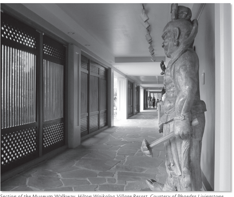
Section of the Museum Walkway, Hilton Waikoloa Village Resort.

Uncommon a generation ago, culturallysensitive collecting and display techniques and visitor-centered approaches are now core aspects of professional ethics and best practice in public museums. Between government divestment of funds and the opening of new corporate museums, museum privatization is a growing global trend. Private museums are