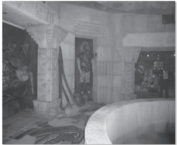
The Dig at the Atlantis Resort, Nassau, Bahamas.

Moving further to the right of the spectrum, we have the Museum Walkway at the Hilton Waikoloa Village, on the big island in Hawaii. The display of this hotel's art collection is the most likely to be perceived as a museum exhibition: it is named a museum, applies traditional art museum display techniques and labeling, and offers a guidebook (Goude, 2005) with information on the art and artifacts. This destination resort spans 62 acres, spread along the waterfront, isolated from any local communities. Guests must use a tram, boat, or mile-long walkway to get from one side of the hotel's grounds to the other. Most use the tram, which plays a recording directing passengers' attention to, among other things, the walkway exhibition, which was "...curated by a professional art curator. There are more than a thousand pieces to see... worth millions of dollars." This same short recording asserts the collection reflects the "cultural cross-section of many of Hawaii's earliest settlers" with pieces from Asia, Oceania, Western Europe, and Hawaii. The great majority of works are from Asia; relatively few are from ancient or contemporary Hawaii. Yet, the tram statement continues: "Through the art and display we hope you gain a greater understanding and insight into life in Hawaii." The website reinforces this interest in local culture