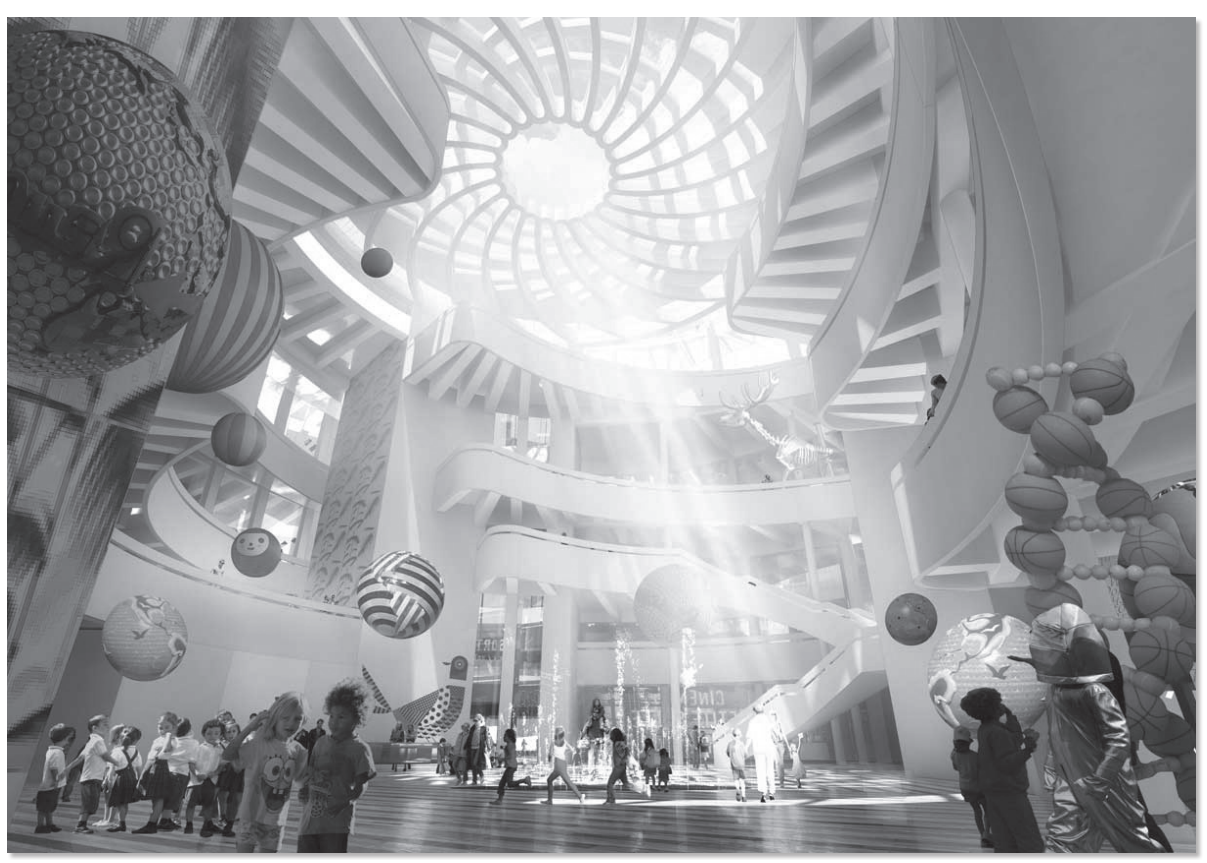
The core of the Discovery Center forms a large communal orientation space surrounded by a web of ramps interweaving the public plateau with the shell structure. Courtesy of Henning Larsen Architects.

working. At times solutions taken from the international context were not as effective in the local setting. As an example, in many western children's museums, insectariums featuring an array of creepy crawlers provide exciting opportunities for visitors to observe and interact with living species. In Syria, however, there is a deep cultural aversion to insects and animals in general because they are perceived to be unclean. After a series of discussions with our Syrian counterparts, we came to an arrangement where "friendly" insects such as crickets and leaf cutter ants were deemed to be acceptable while "dirty" insects such as cockroaches were not.