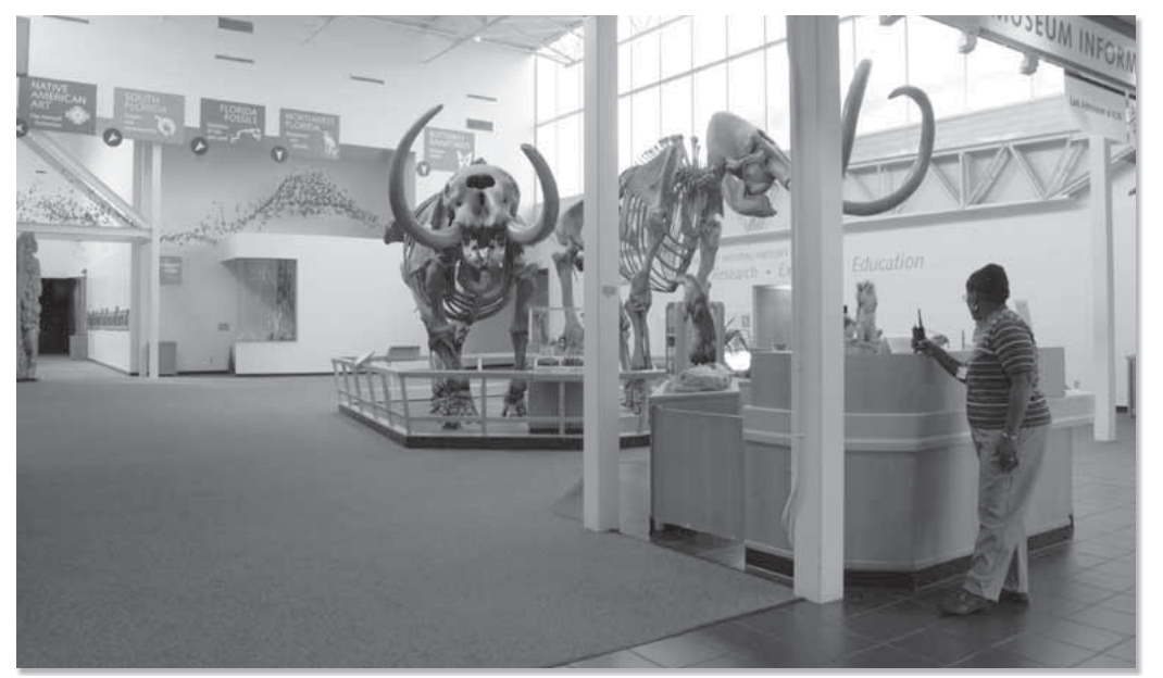
The Florida Museum of Natural History's Great Hall, 2005, with the mammoth and mastodon entrance icon.

of generating interest and funds. Strong positive responses intrigued me. Obviously it hugely improved our sterile Great Hall! But its appeal seemed somehow more profound, potentially offering a way to shape visitor experience. I tasked a graduate student with a visitor study, comparing the current Great Hall to the new concept.